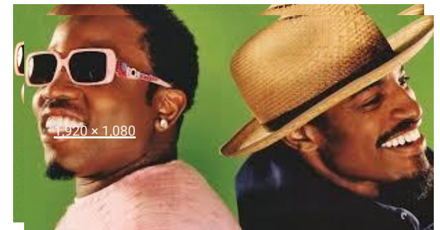
Outkast - Hey Ya