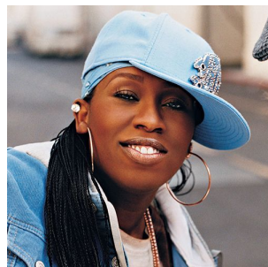
MC Hammer Missy Elliot