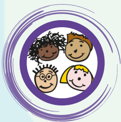
Bowes Primary School